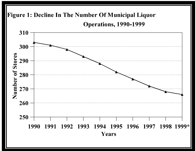
Figure 1 shows the decline in the number of municipal liquor stores.

Due in part to the lack of profitability and therefore the inability to provide this additional revenue source, the number of cities operating municipal liquor stores has steadily declined. In 1998, four cities discontinued their liquor operations; in 1999, three more cities discontinued their liquor operations. Of the three cities that opted to discontinue their municipal liquor stores in 1999, Oronoco and Pine River reported operating losses in 1999, while Mantorville reported an operating profit.